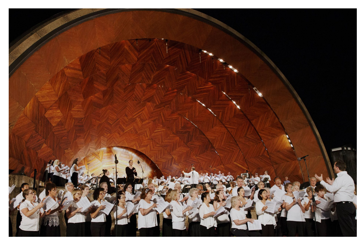
Boston Landmarks Orchestra with One City Choir and ASL interpreters.