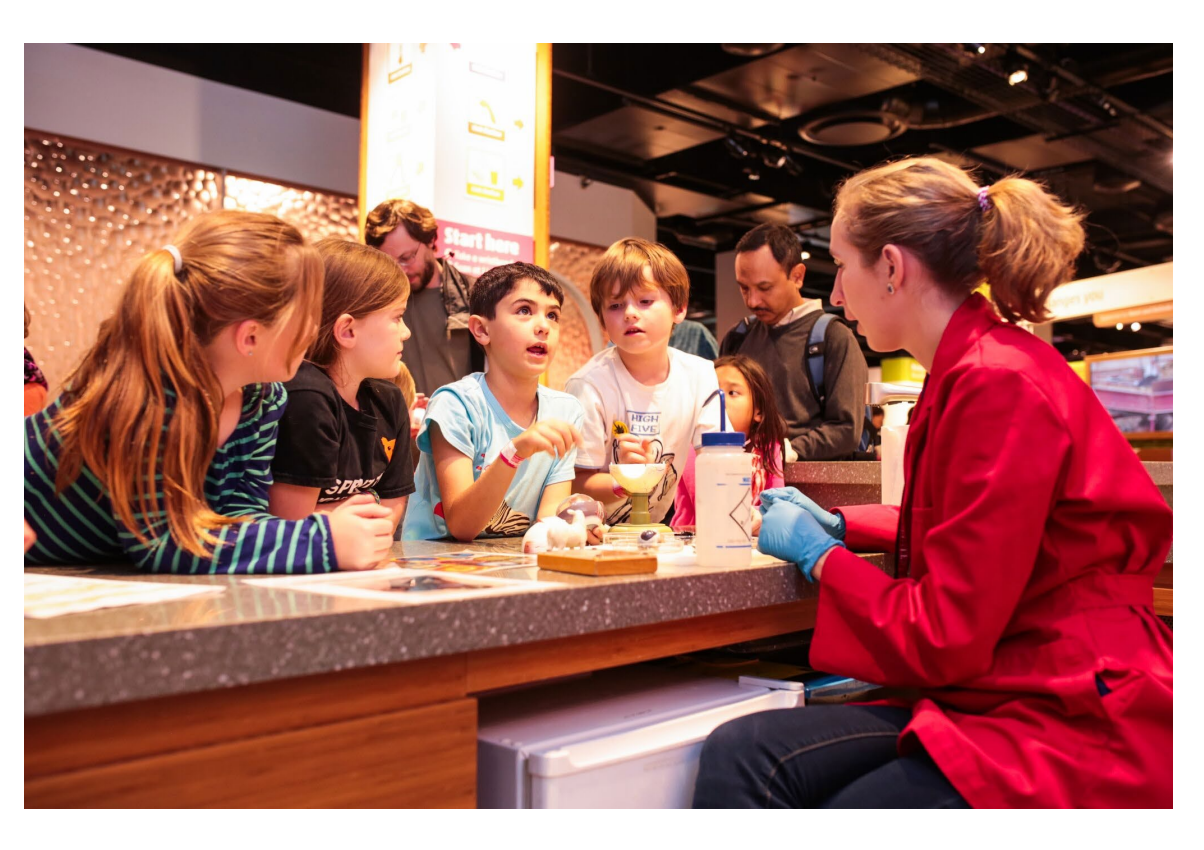
Museum of Science educational program.