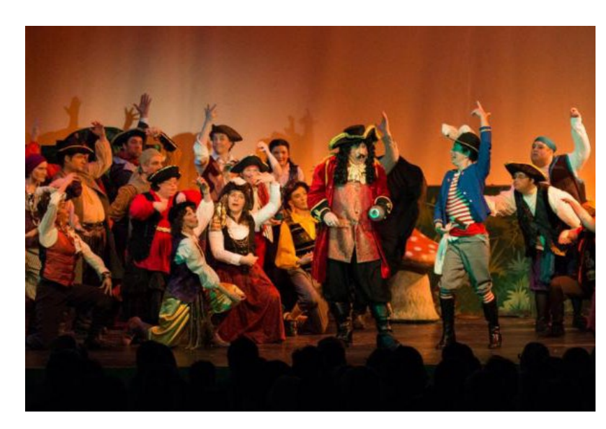
Open Door Theater Peter Pan