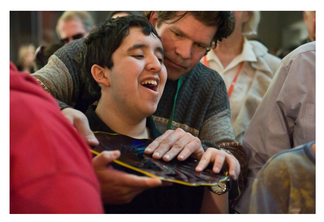
Chihuly Element at Chihuly's talk with Perkins teens and others.