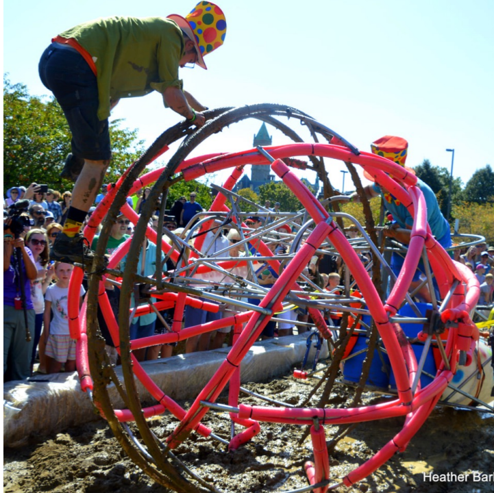
Lowell Kinetic Sculpture Race

Either an unincorporated organization with a non-profit objective