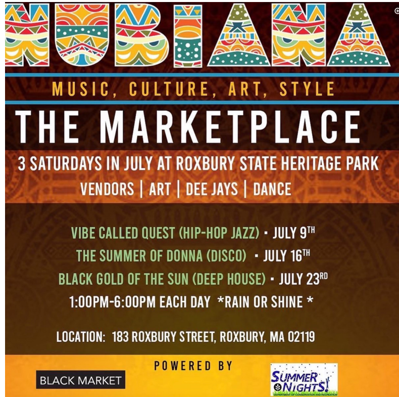
Black Market Nubian event poster