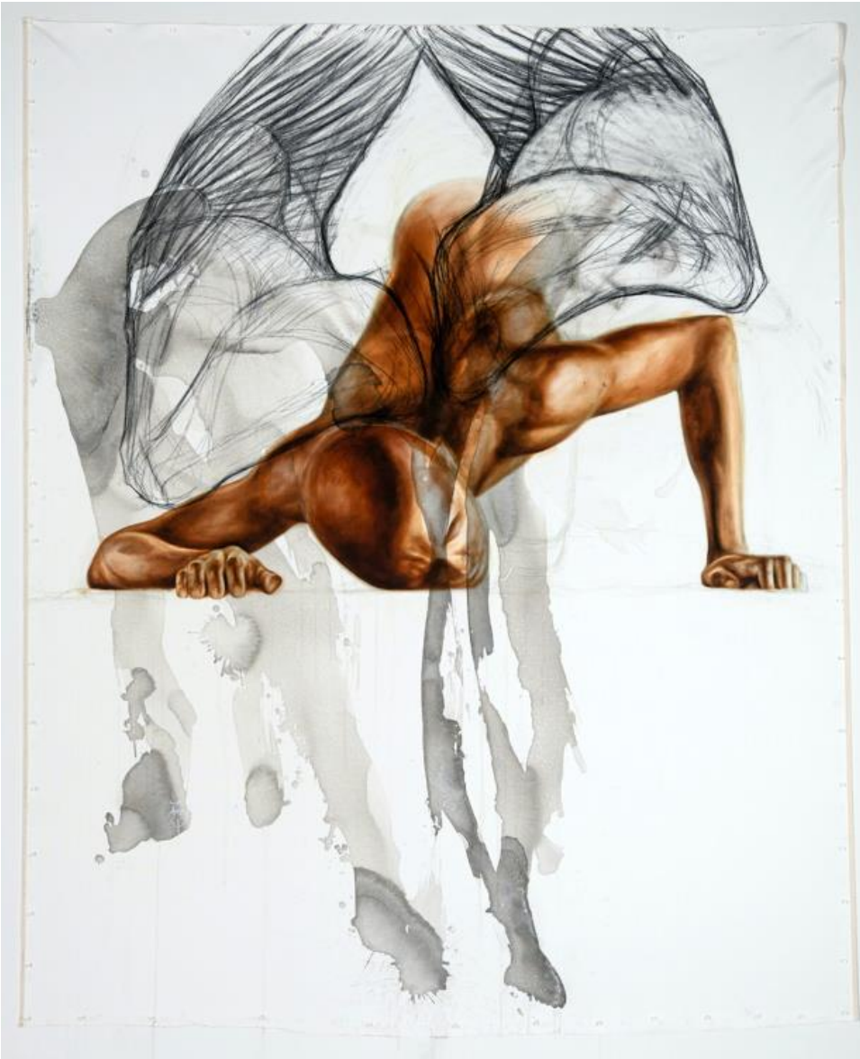
Angel Landing (2020) by Imo Imeh.