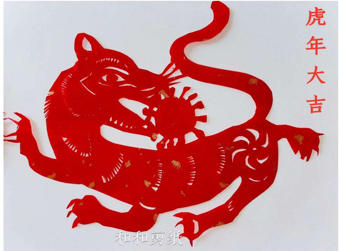
Cut paper tiger by Zhonghe (Elena) Li.

Grantees decide how best to use the support