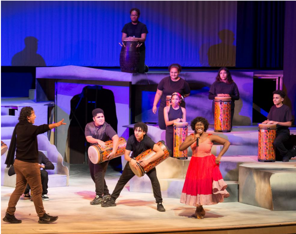
R.evolucion Latina residency with Lawrence High School.