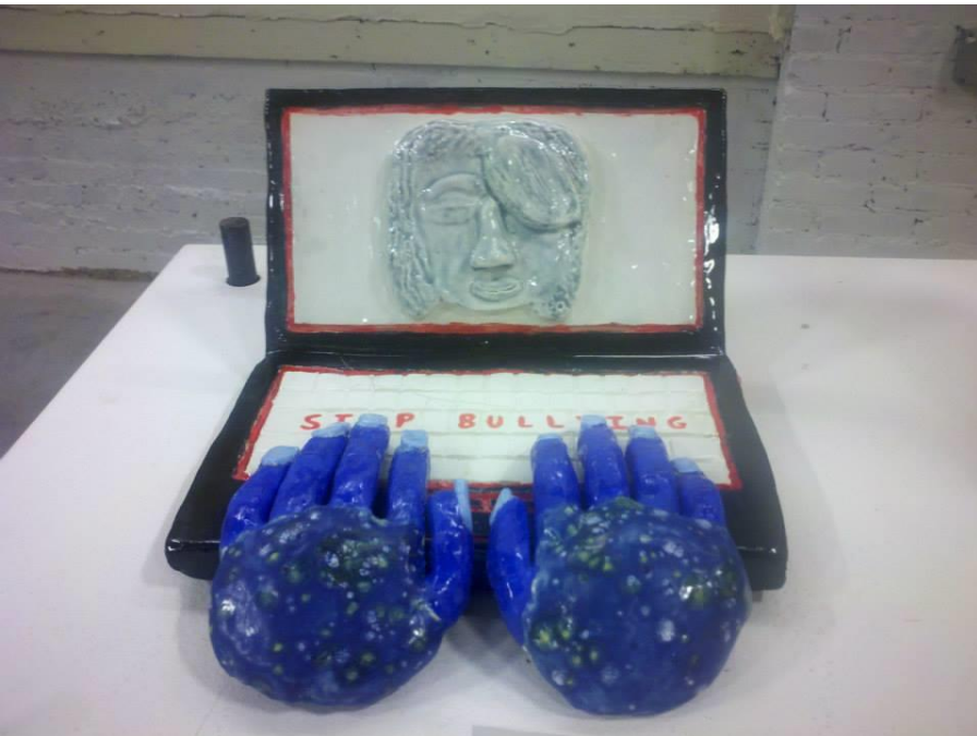
Somerville High School

No budget required for application -- BUT still required in Final Report!