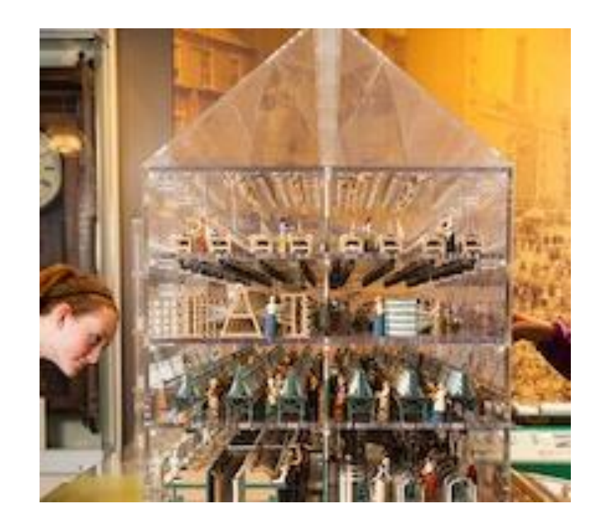
Young people examine an exhibit at the Tsongas Industrial History Center.