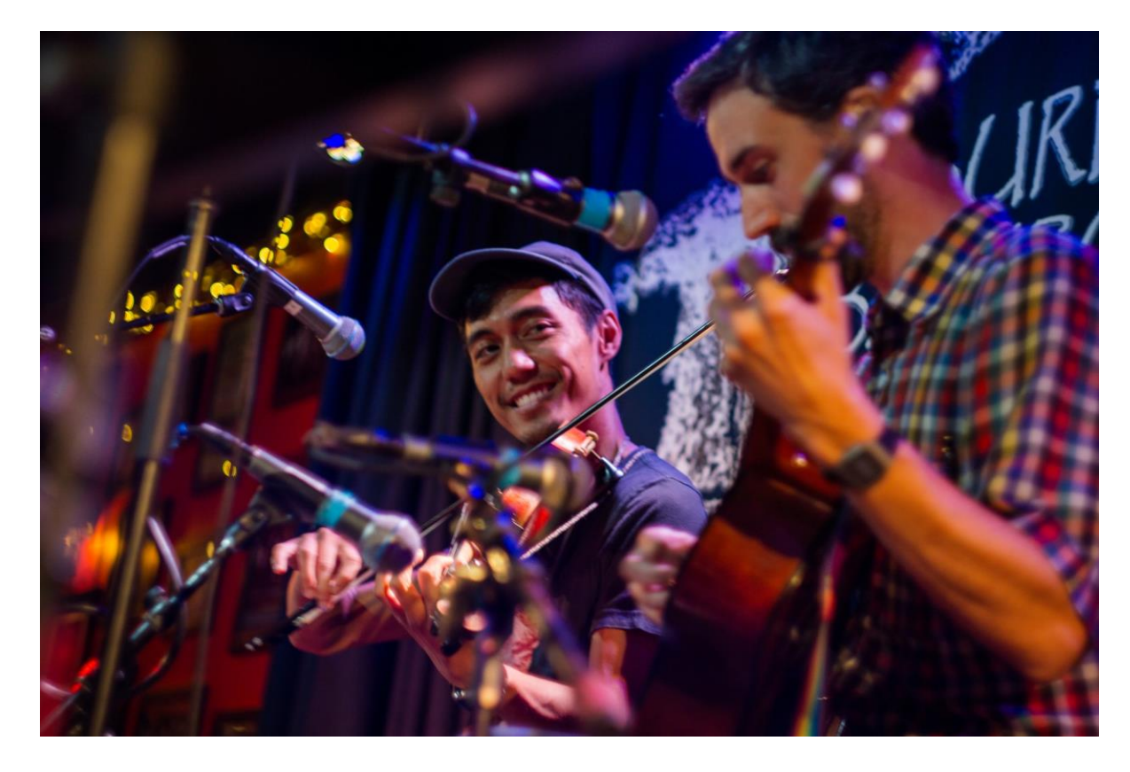
The Vox Hunters perform at The Revels Pub Sings.