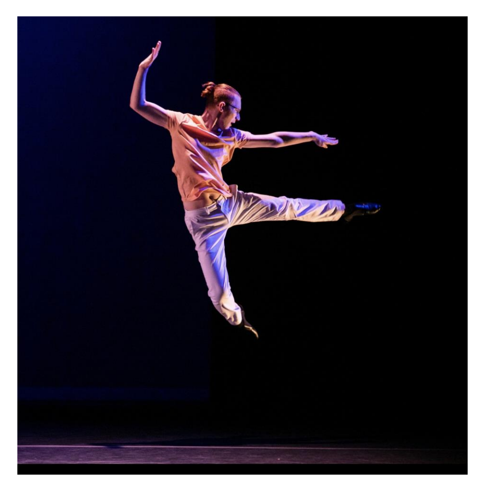
Berkshire Pulse: Spring Celebration Showcase