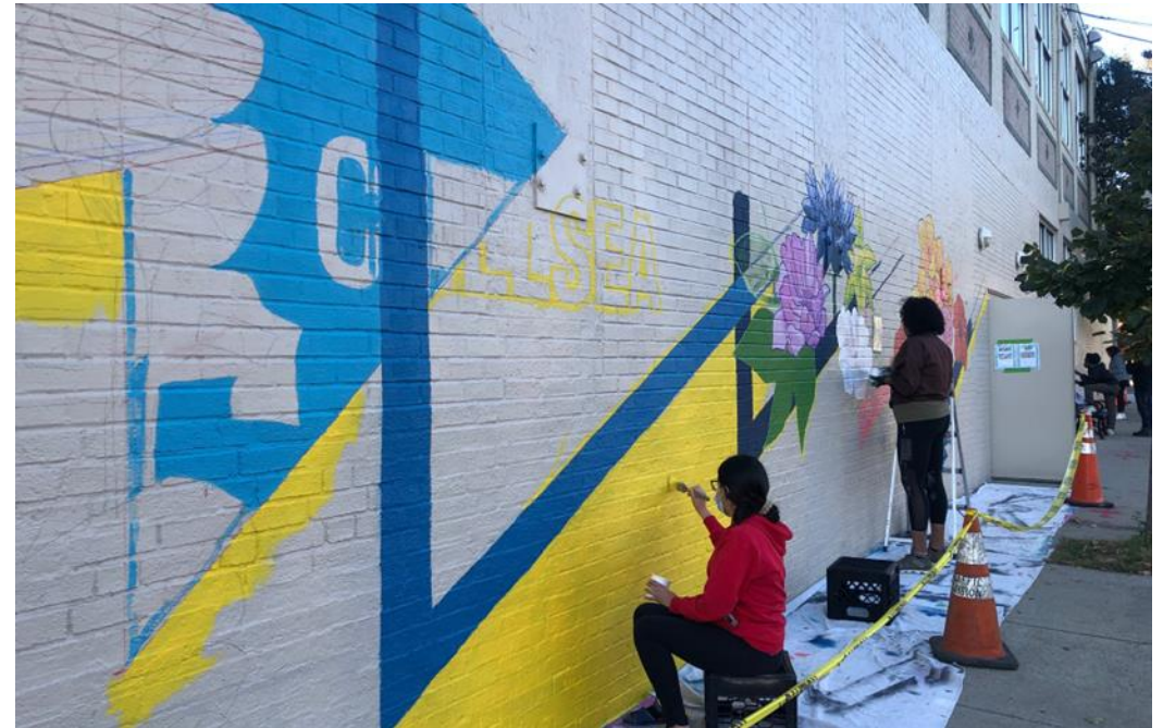
Green Roots, Chelsea

Program is being redesigned, but it will continue to fund creative learning opportunities at schools. (Application opens fall 2024)