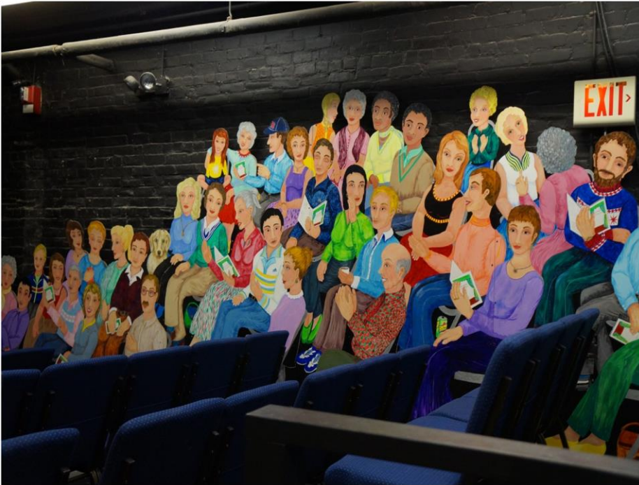
Assabet Village Cultural District | Maynard

A Cultural District Designation is good for 10 years .