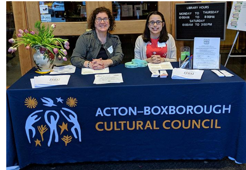
Acton-Boxborough Cultural Council