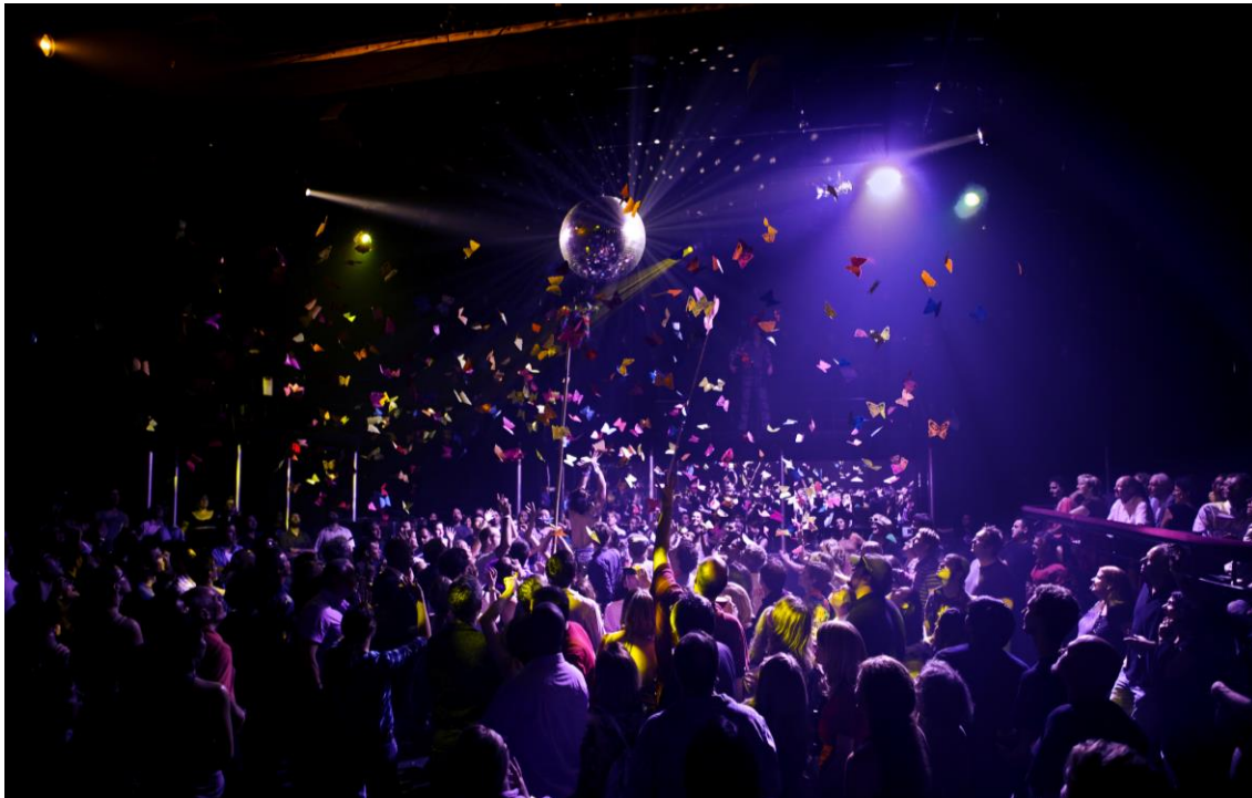
The Donkey Show at OBERON, American Repertory Theatre

Arts and cultural attractions help drive tourism. The AEP6 study, conducted by Americans for the Arts found: