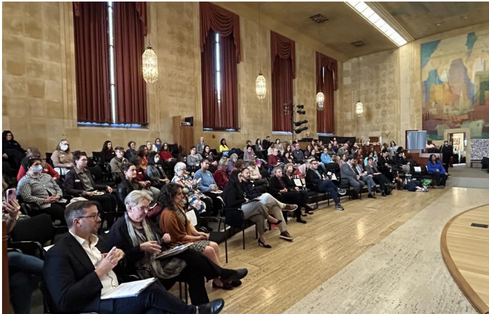
Health & Wellness through Creativity Panel Event | October 2023

We've built a strong foundation and taken action to establish and reignite relationships with key collaborators to embed the arts more prominently within key sectors across the Commonwealth: