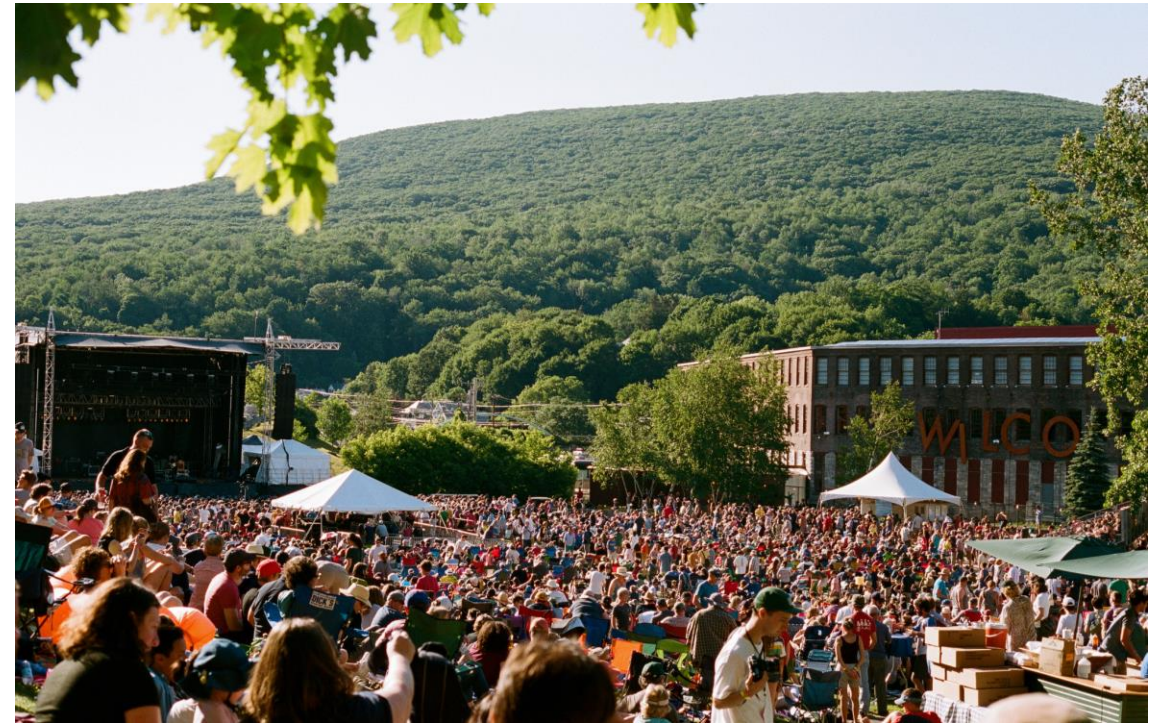
MASS MoCA, Solid Sound Festival