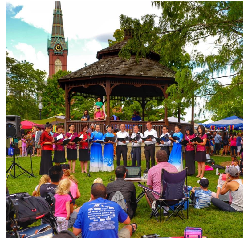
Multicultural Day | Natick Cultural District

Join us for our next webinar for even more inspiring examples and ideas of how to use the arts to improve your city town!