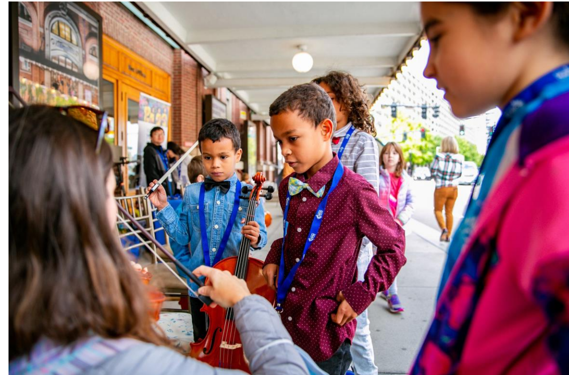
Fenway Cultural District's Opening Our Doors day.