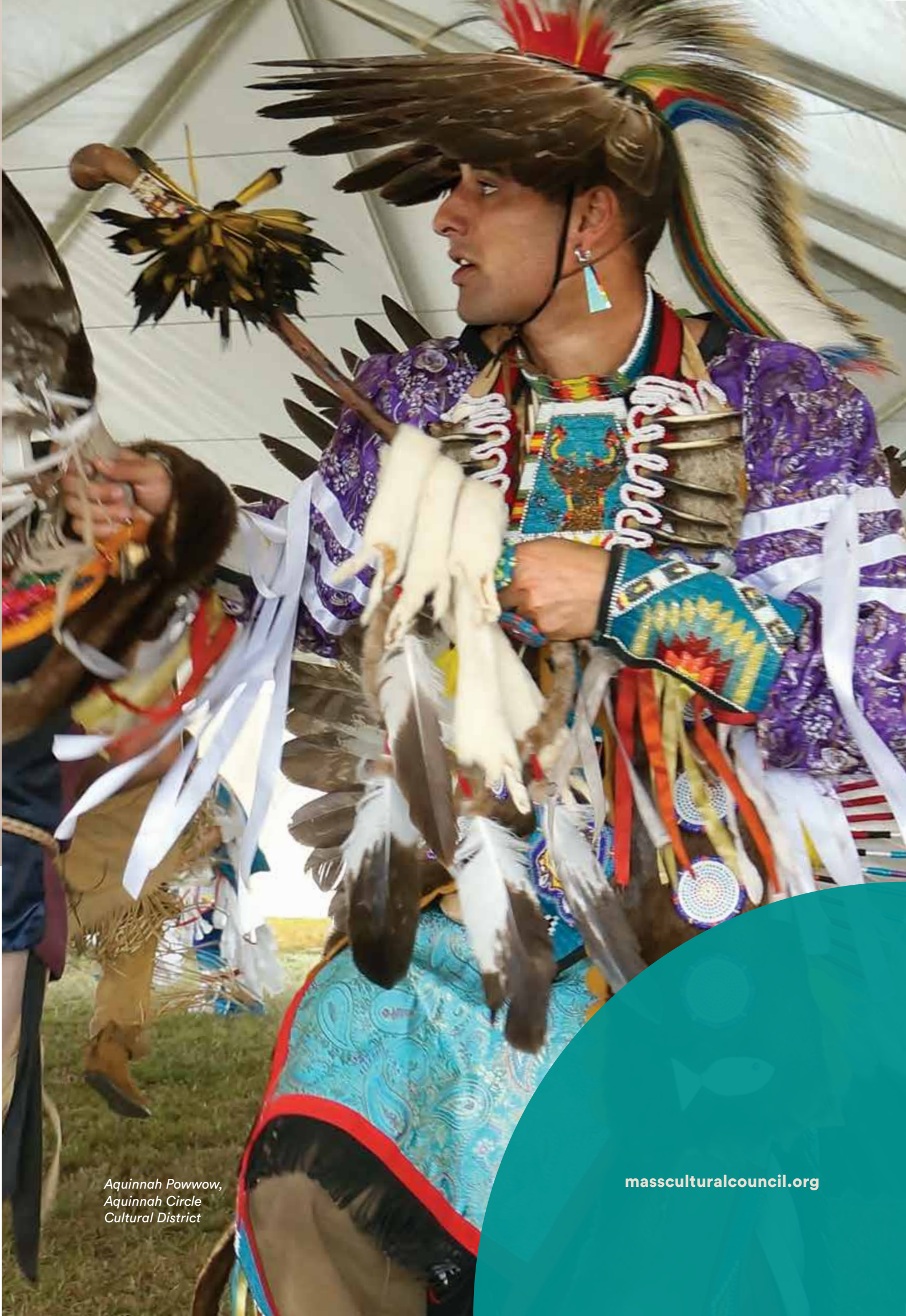
Aquinnah Powwow, Aquinnah Circle Cultural District