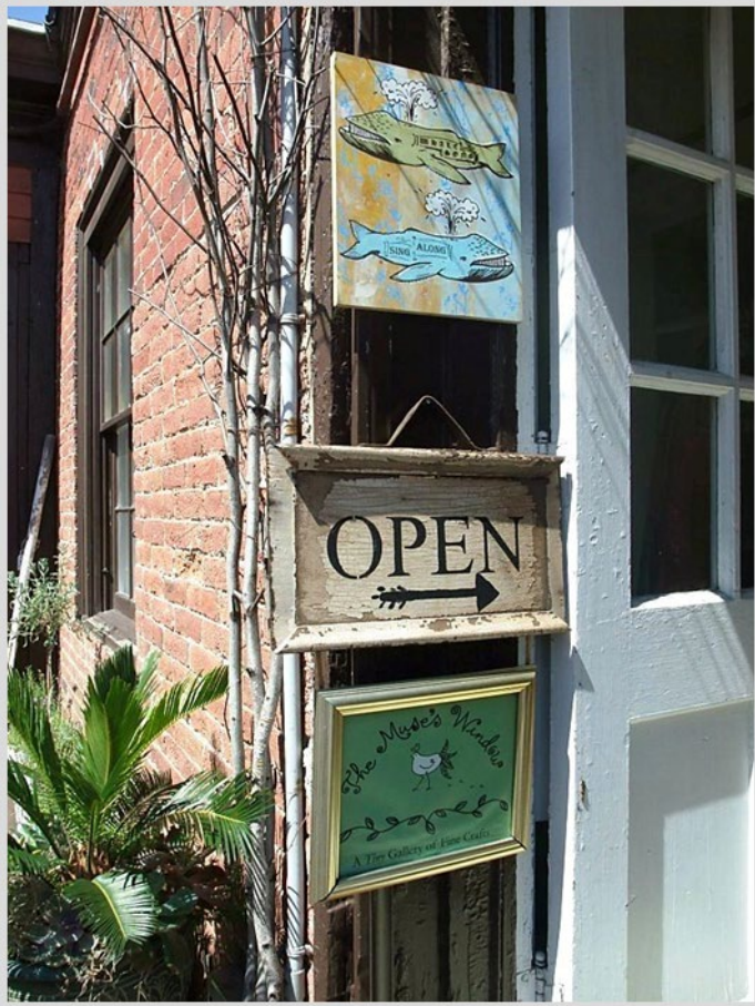
Concord Cultural District