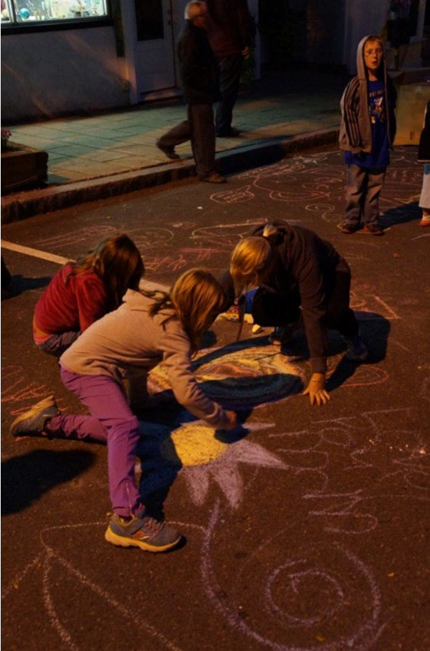
Arlington Street Fair