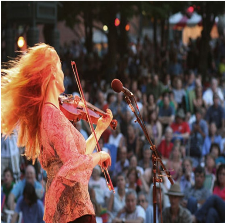
Lowell Folk Festival