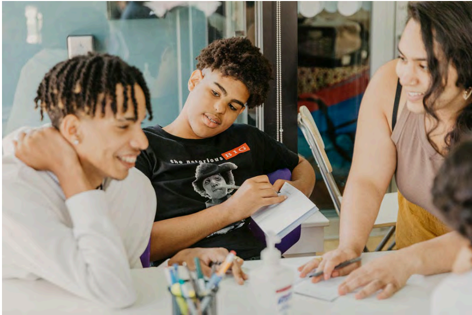
Two of Sociedad Latina's Youth Artists work with a teaching artist from Berklee College of Music on songwriting and lyric writing.

(self -discovery, healing, collaboration, and mutual learning)