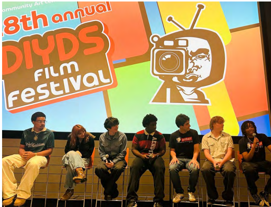
Cambridge Community Art Center's 28th Annual Do It Your Damn Self!! National Youth Film Festival