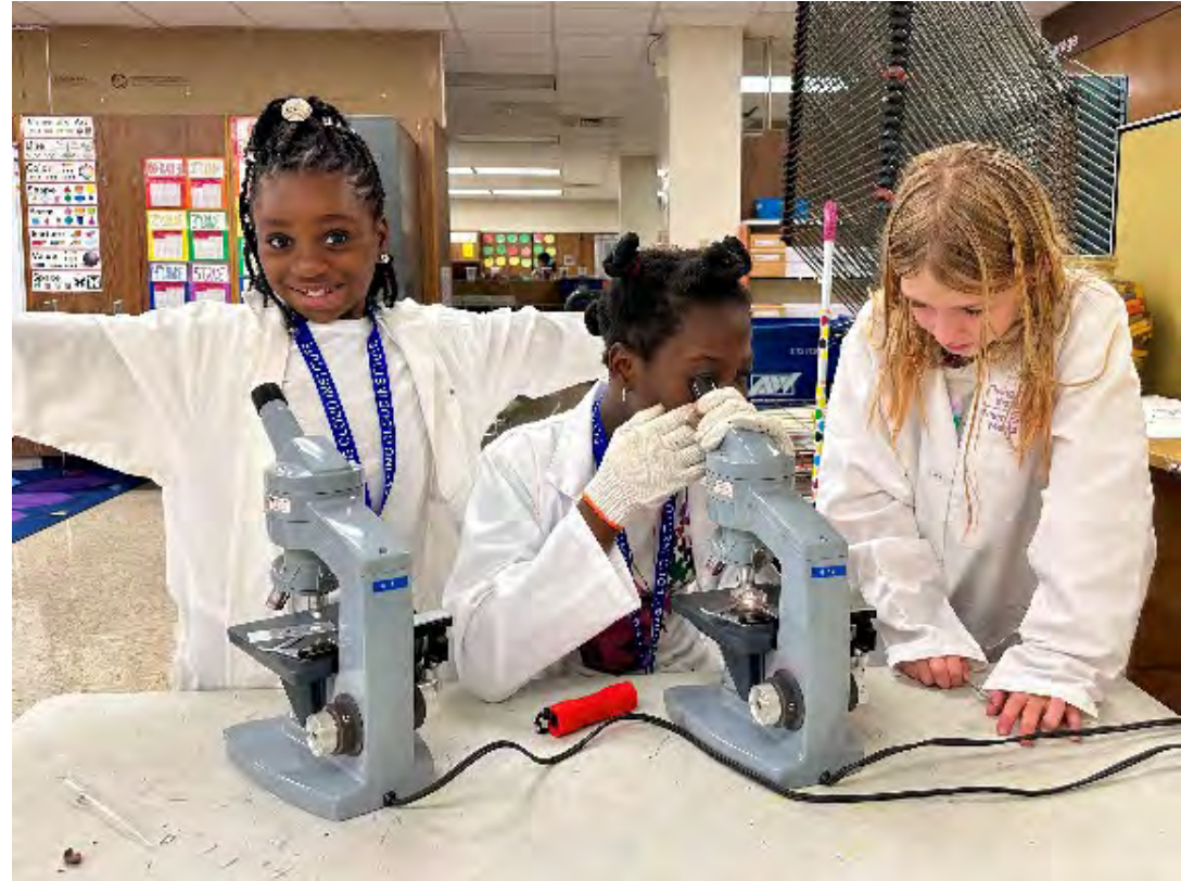
Flying Cloud. The Conte Elementary School Girls Science Club prepared microbiology slides after a plant dissection. Photo: Angel Heffernan, 2024

Proposed programs may take place after-school , out-of-school, or possibly during school hours.