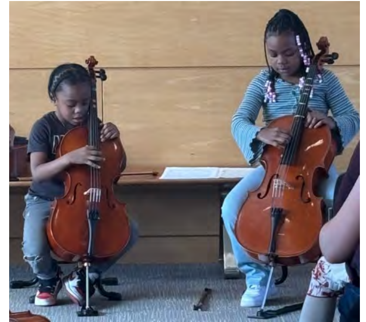
musicconnects, End of year concert at the Mattahunt School.

You can find more information about eligible fiscal agents in our online FAQs