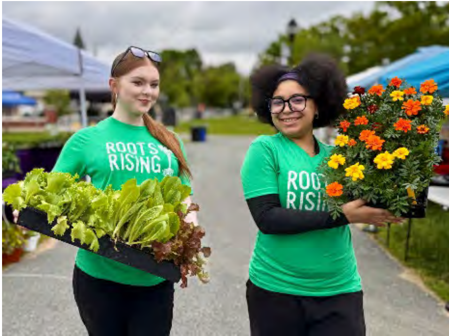
Roots Rising Market Crew teens showing off locally grown plants sold at the Pittsfield Farmers Market.

94% of their young people felt more prepared for the workforce and had a stronger work ethic and 100% had more pride in their community – Farm Crew, Roots