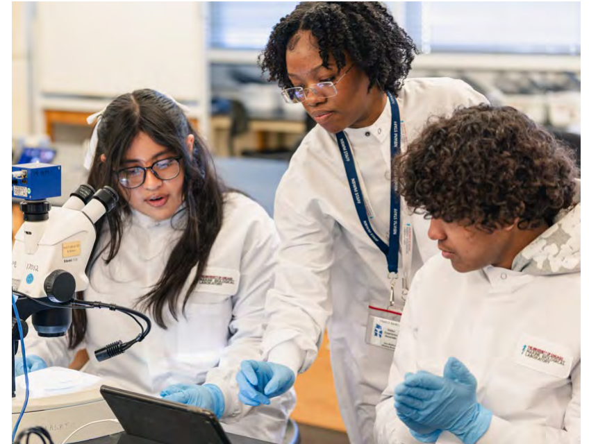
New Bedford Whaling Museum High School Apprentices engaged in a three-day High School Science Discovery program at the Marine Biological Laboratory at Woods Hole, Massachusetts.

Applicants that have completed the Arts and Culture Accessibility Self-Assessment