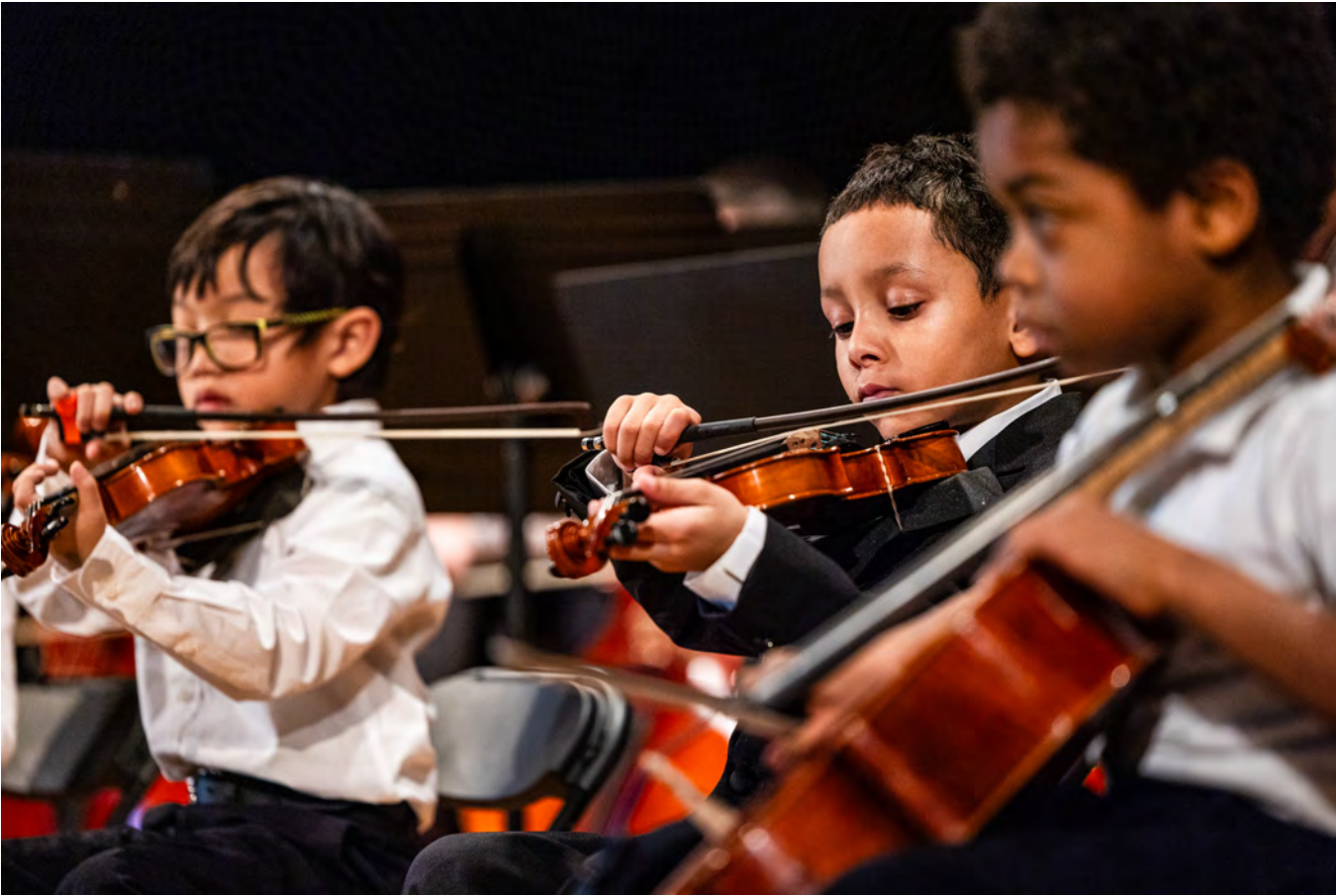
City Strings United's Early Learners class performs in "Stringfest" at the Kroc Center in Dorchester, in a collaborative concert presented by Celebrity Series' Neighborhood Arts Initiative.

“Creative Youth Development is a recent term for a longstanding practice that integrates creative skill-building, inquiry, and expression with positive youth development principles, fueling young people’s imaginations and building critical learning and life skills.”