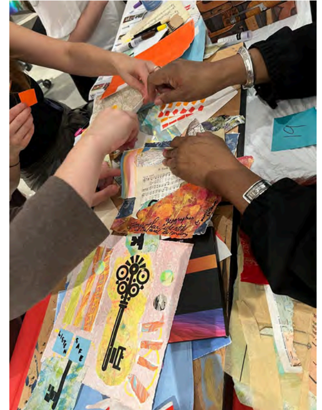
Youth Arts Impact Network Art Making: Keys to Belonging..

**All awards are contingent upon Mass Cultural Council's allocation and receipt of sufficient funds from the Commonwealth of Massachusetts and National Endowment for the Arts.