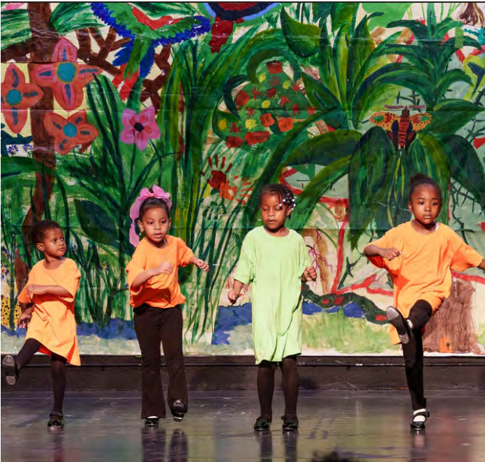
Ballet Rox Recital Students performing at the spring recital "Movement for the Earth" Photo: Arthur Barabell, 2025