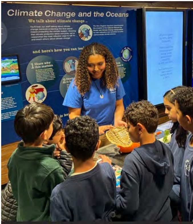
New England Aquarium, NEAq ClimaTeens Presentation