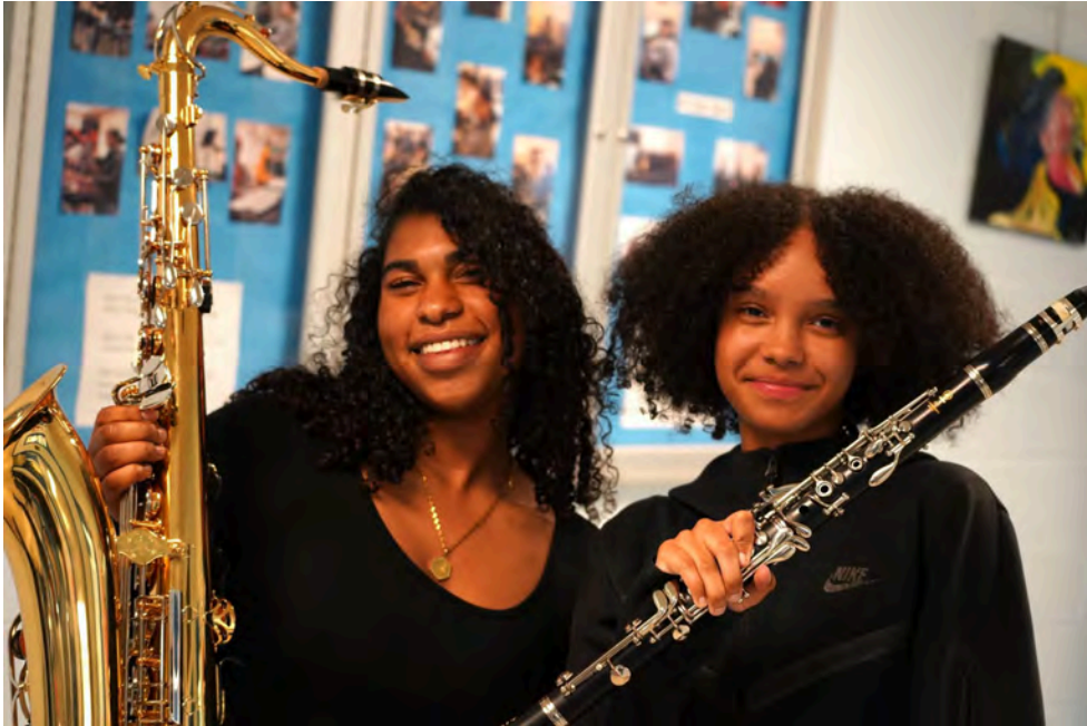
Margarita Muniz Academy