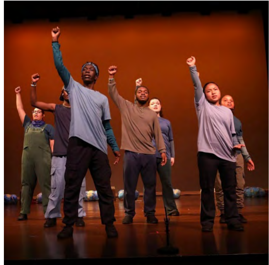
Performance Project, Young people performing in First Generation's Mother Tongue, at UMass Bowker Auditorium. Photo: Ed Cohen, 2024