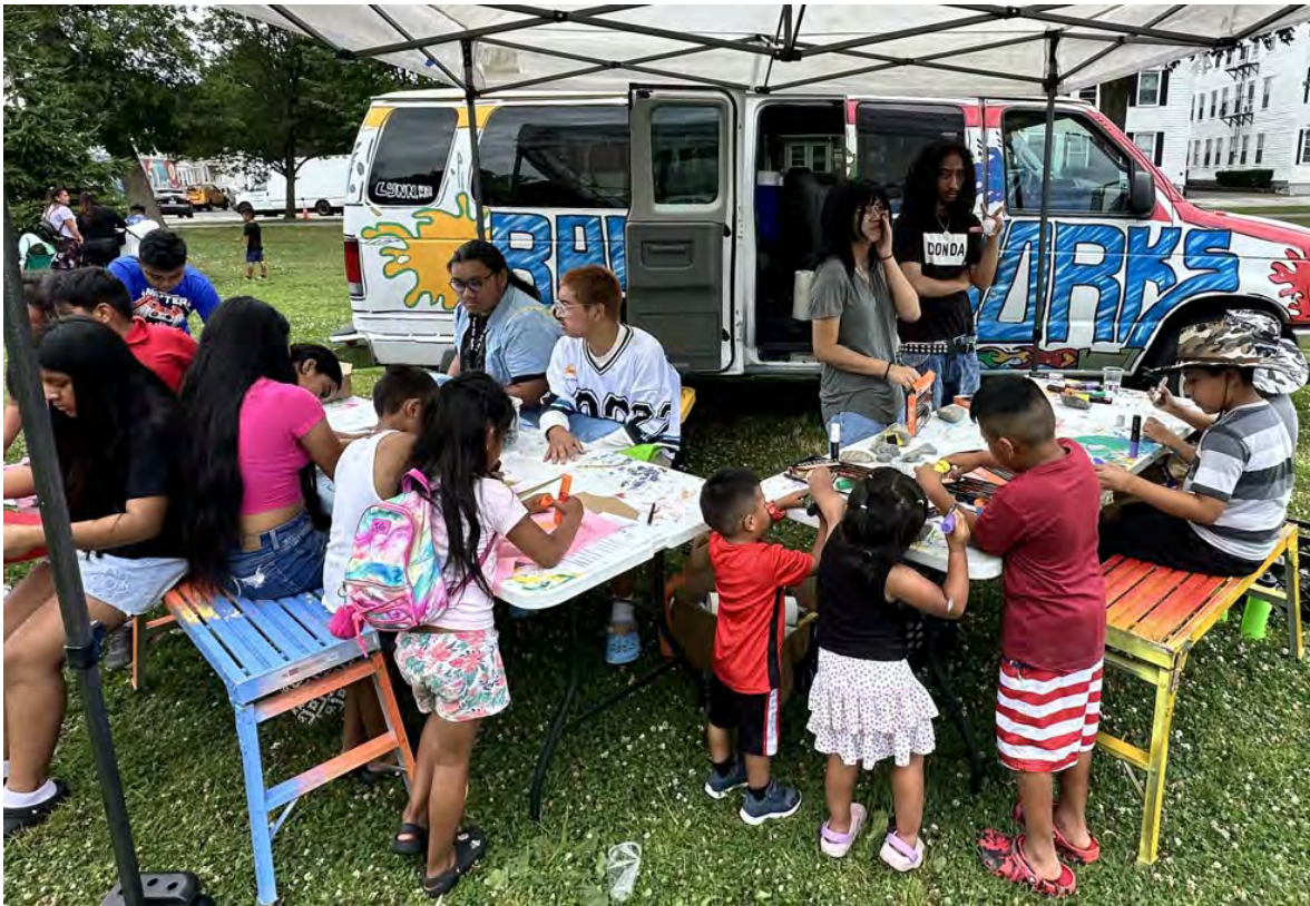
Raw Art Works, RAW Stars lead a VanGo art activity at a park in Lynn. Photo: Staff, 2024.