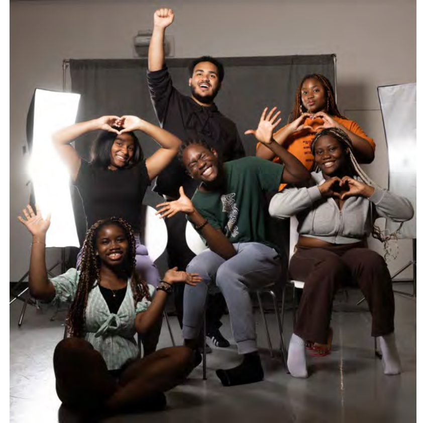
Hanover Theatre. The cohort of WYSH poses during their studio rehearsal, Photo, Unity Mike, 2024.