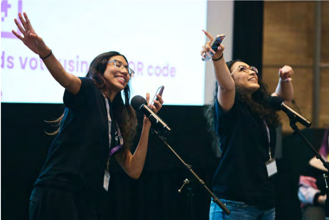
MassPoetry, Photo: Francois Visuals, 2025

99% reported, “writing or performing poetry allows me to express my identity in a safe space.”