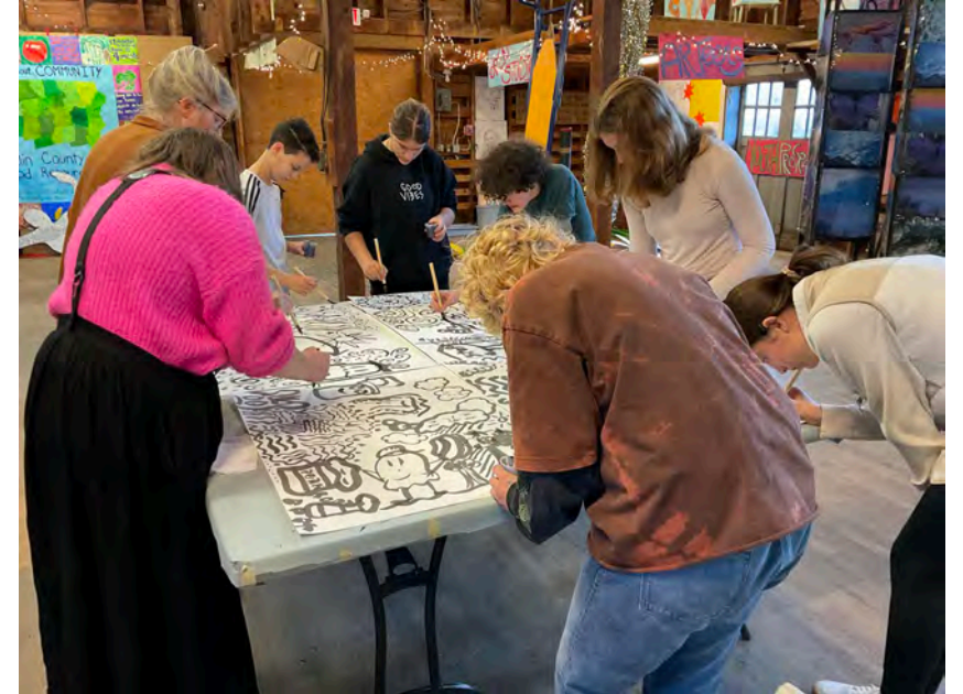
Art Garden, Fall ARTeens group doing an ink icebreaker exercise.