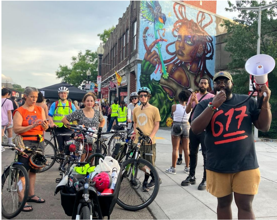
Dorchester Mural Bike Tour (Part of Dorchester Open Studios) Boston, MA – Photo courtesy of Boston Cyclists Union