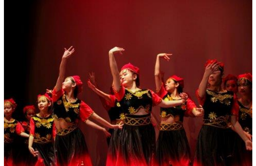
Chinese Culture Connection's Lunar New Year Celebration, Malden, MA