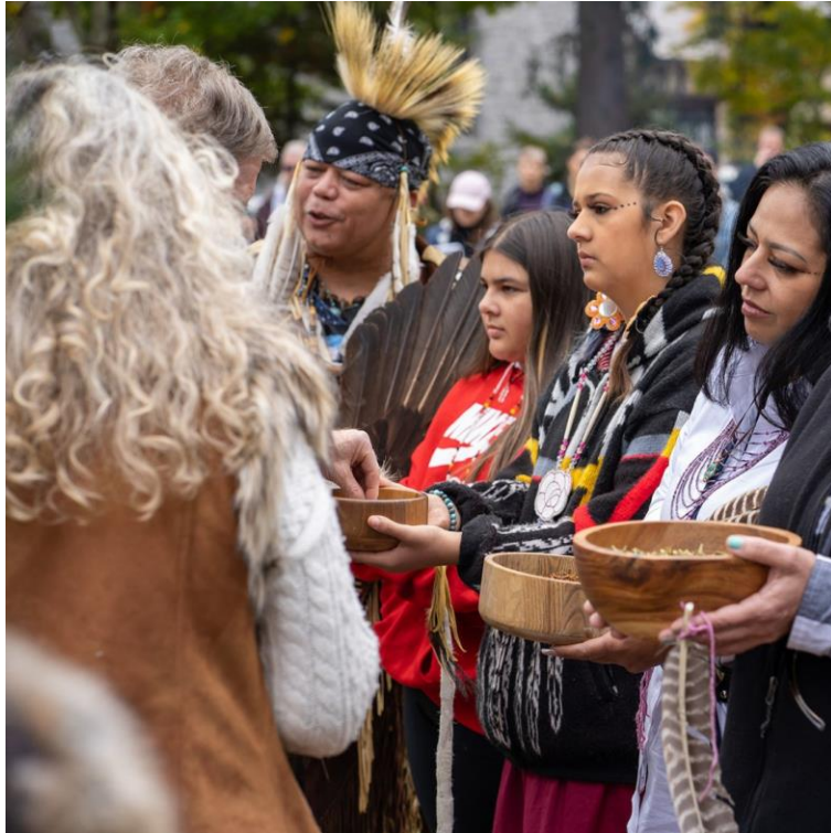
“Alliance from a Viable Future” for Indigenous Peoples' Day , Great Barrington, MA