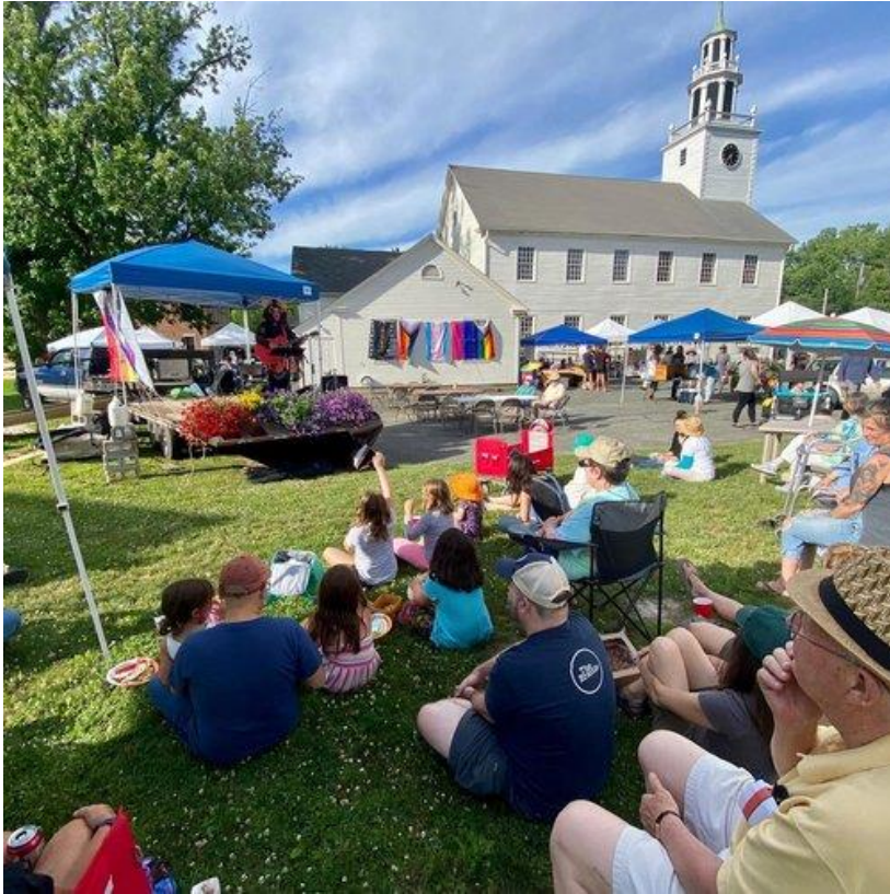
Sheffield Pride Festival, Sheffield, MA