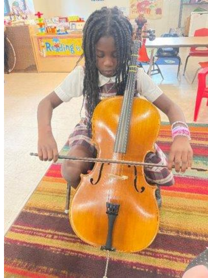
Neighborhood Strings Learning First