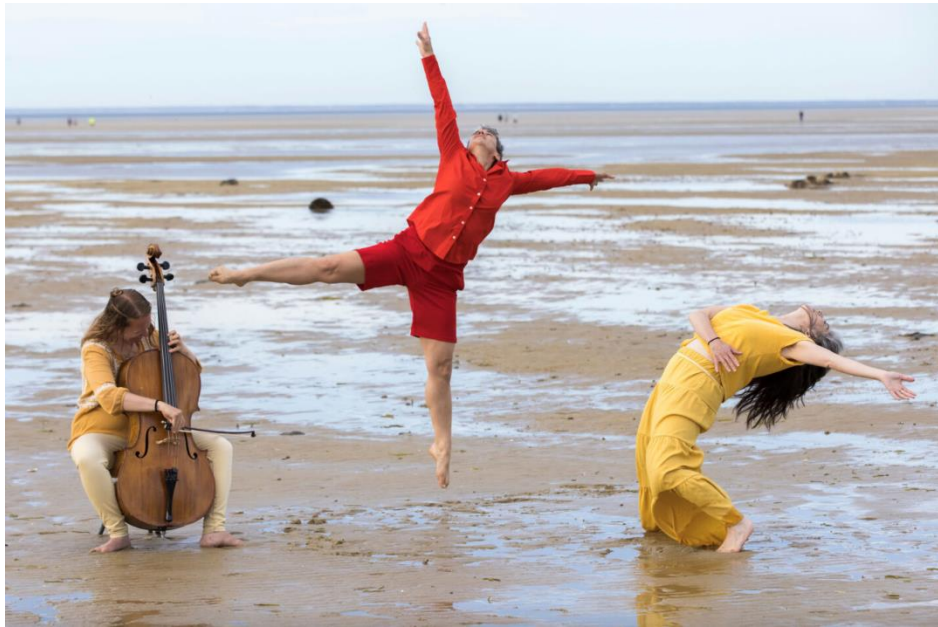
Beyond the Bounds Performance Series, Cape Cod Region, MA