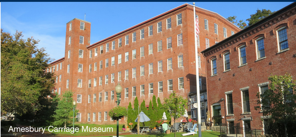
Amesbury Carriage Museum