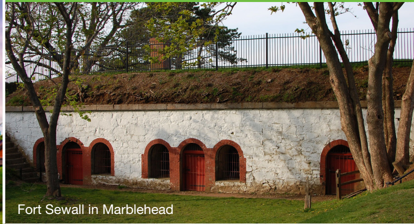
Fort Sewall in Marblehead