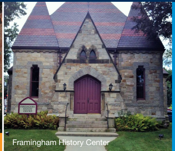
Framingham History Center