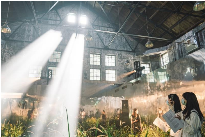
Hear the Light , Installation Art: Light, Sound, Nature, 13' x 36' x 39'