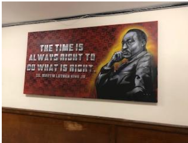
Picture board from Whaling City Jr/Sr. High School