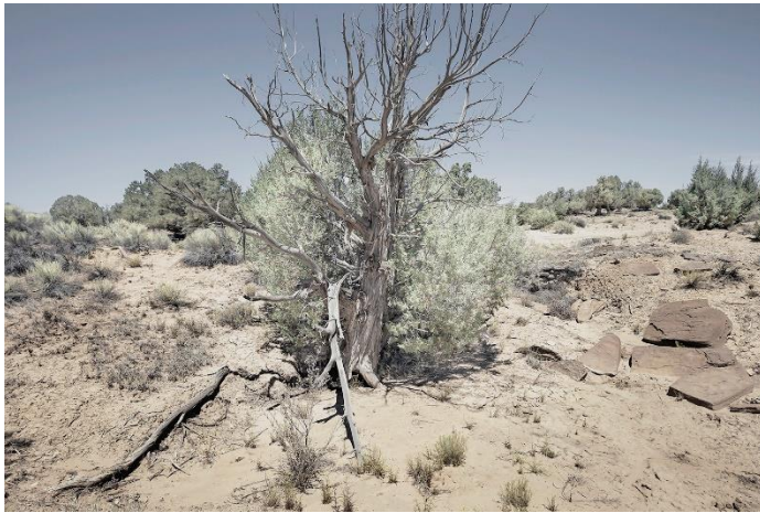
Big Uncle's Spring, Painted Desert, AZ , archival pigment print, 20" x 30" x 1"