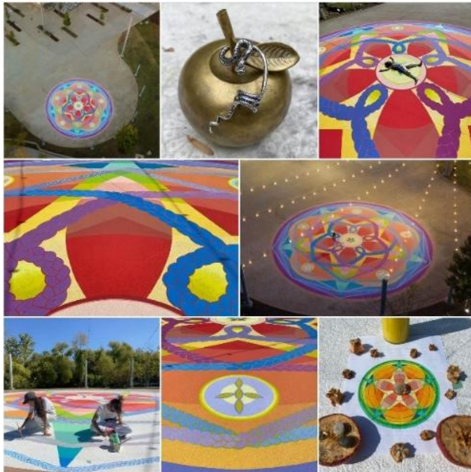
Venusian Rosaceae (Five Seeded Star)

industrial paint on concrete, participatory performance 50' x 50'