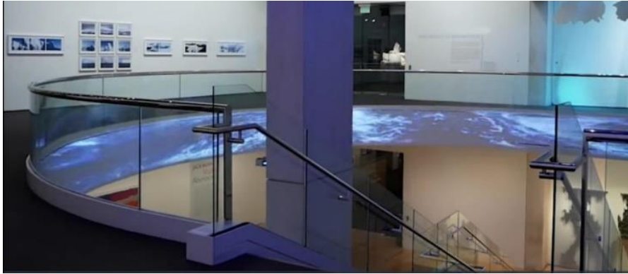
Below Churning Ice, 2019

Polished aluminum, rotating motors, hanging hardware, blue and white lights