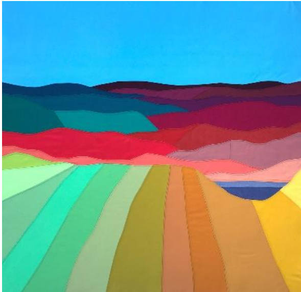
Landscape XIV , Cotton Fabric, Thread, Quilt Batting, 31" x 31" x 0.25"