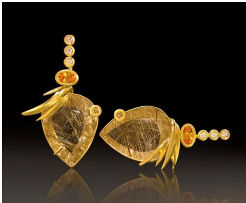
Windswept beach grass golden rutile drops on diamond tops , 18kt gold, golden rutile, diamonds and spessartite garnets, 1.5" x .6" x .5"