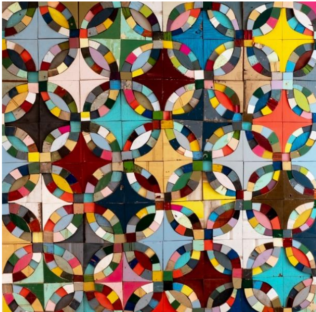
Entanglement , Salvaged wood collected after natural disasters, 48" x 48" x 1"