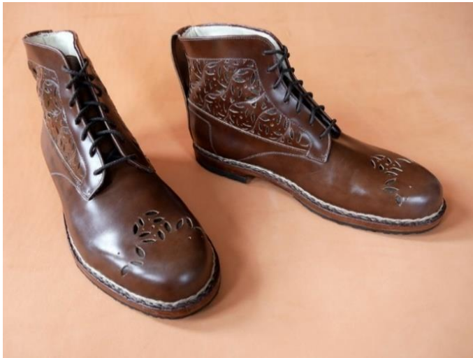
Bespoke leather derby ankle boots , leather, metal, rubber, thread, 6" x 8" x 11"