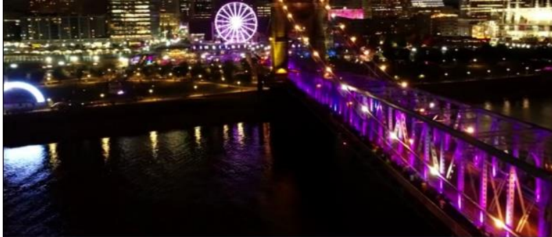
Rumble, site-specific installation