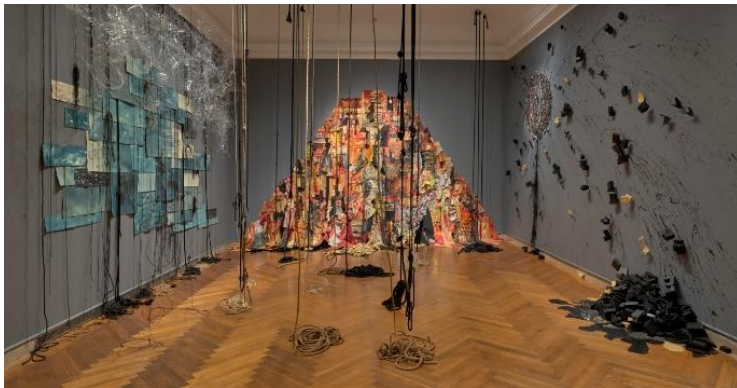
New World Overview , canvas, cloth, paper, foil, rope, plastic, and acrylic, 17' x 60' x 18'