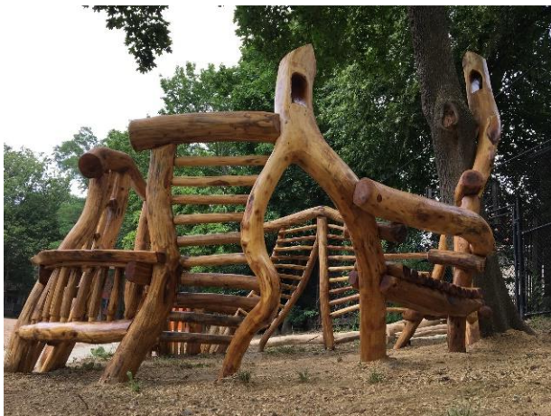
Fantasy Playhouse , Wood, 10' x 15' x 15'