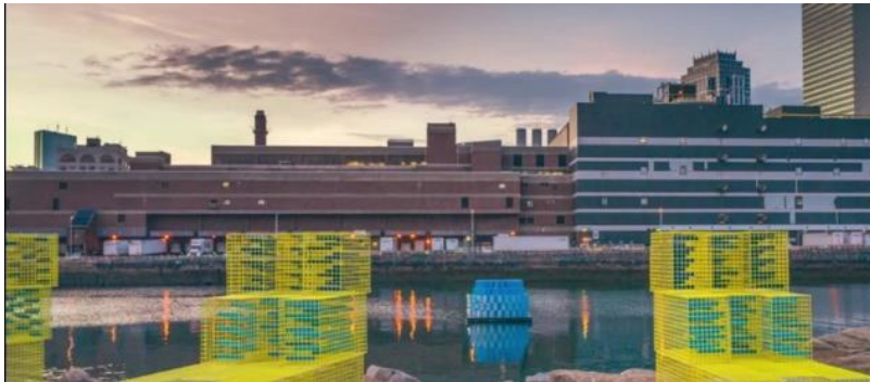
FutureWATERS | AGUASfuturas (2018)