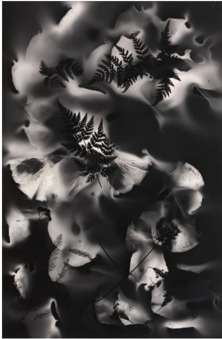
Luminous Herbarium , mushroom spores on paper, 30" x 20"