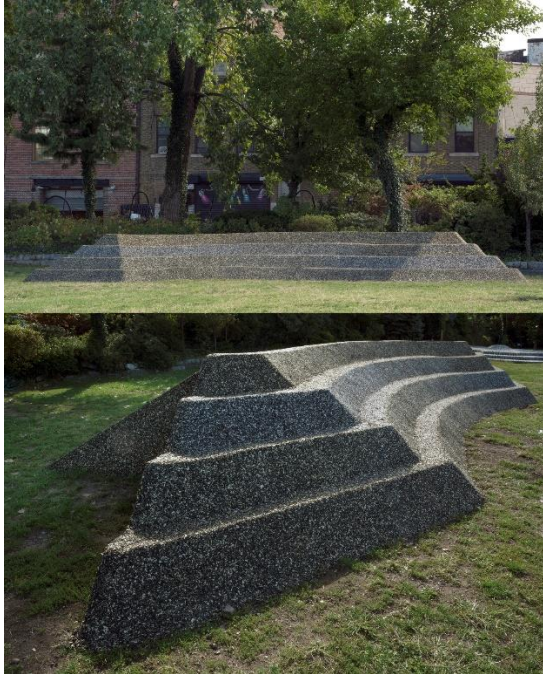
Apparition , Sculpture, 4' x 40' x 16'