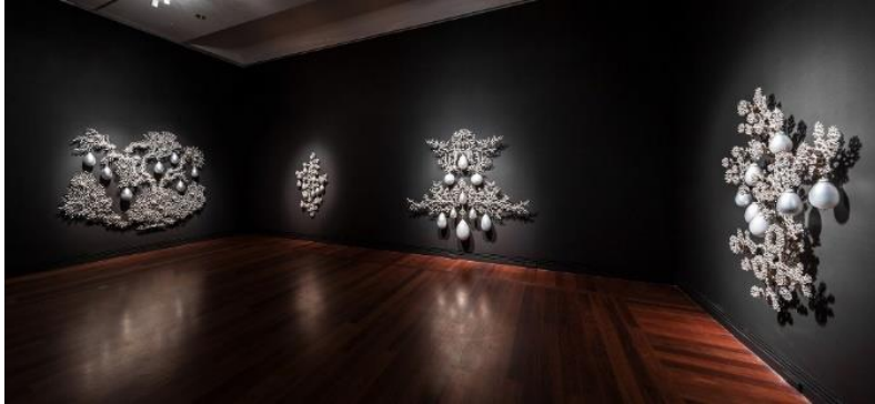
Gorgonia 15 , nickel-plated bronze, mirrored blown glass, 84" x 90" x 9"