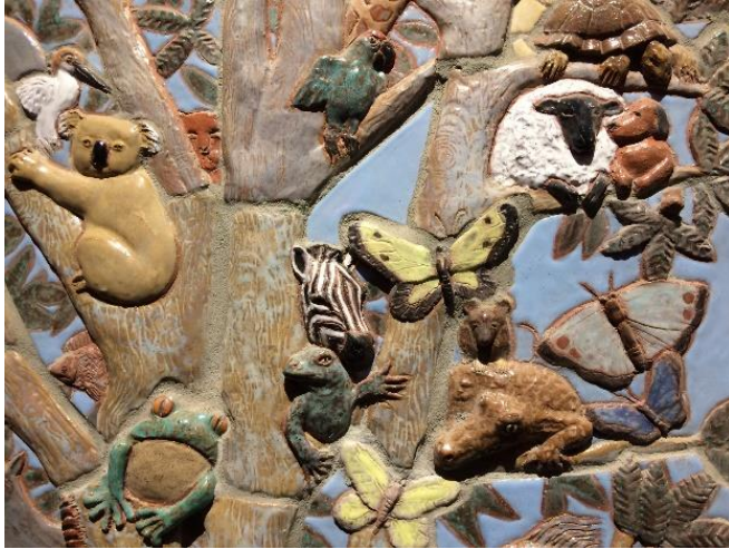
Tree of Life detail , Ceramic tiles, 48" x 36" x 2"