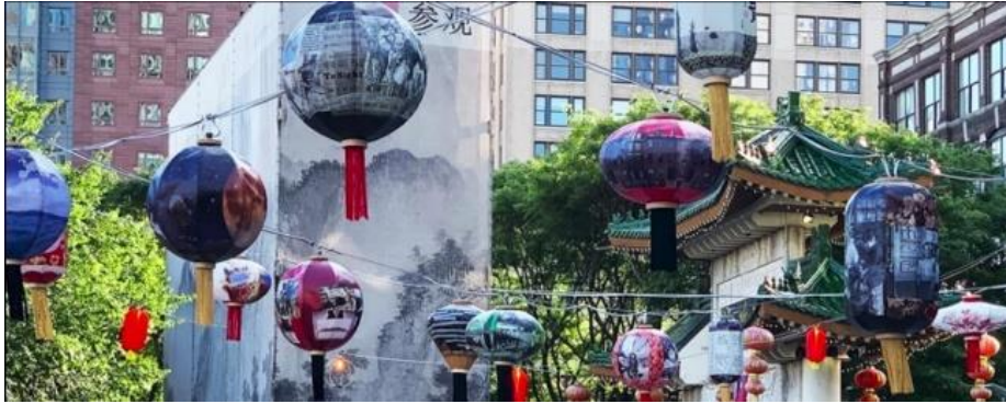
Lantern Stories, site-specific installation