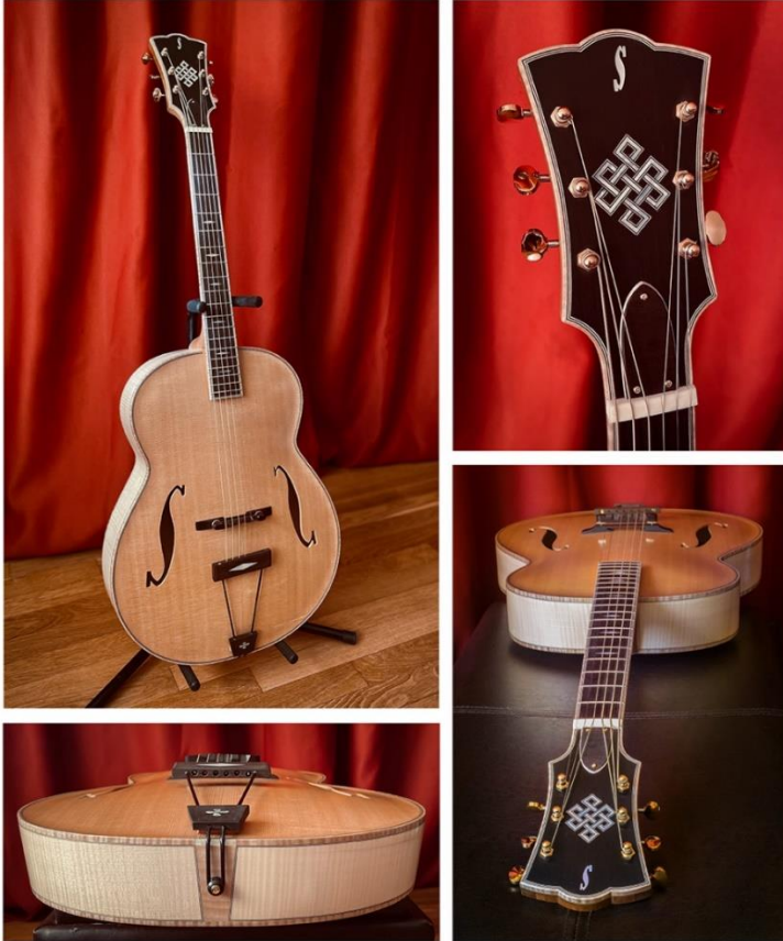
Acoustic Archtop Guitar , Guitar Making, 41.25" x 16.5" x 5"