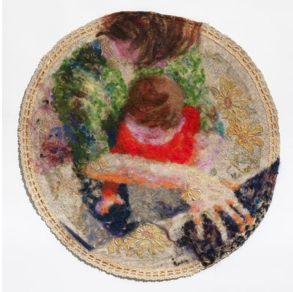
Work in Progress , Needle felting, watercolor on vintage fabric, 22" x 22"