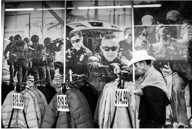
Untitled 1 , photography, 8" x 12"