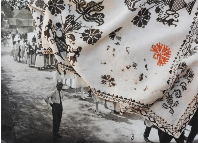
Filling the Blank , Archival Pigment Print with Unique Embroidery, 21" x 26" x 1"