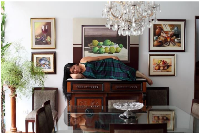
El sueño de María (Maria's dream) , Archival Pigment Print, 12" x 18" x 1"