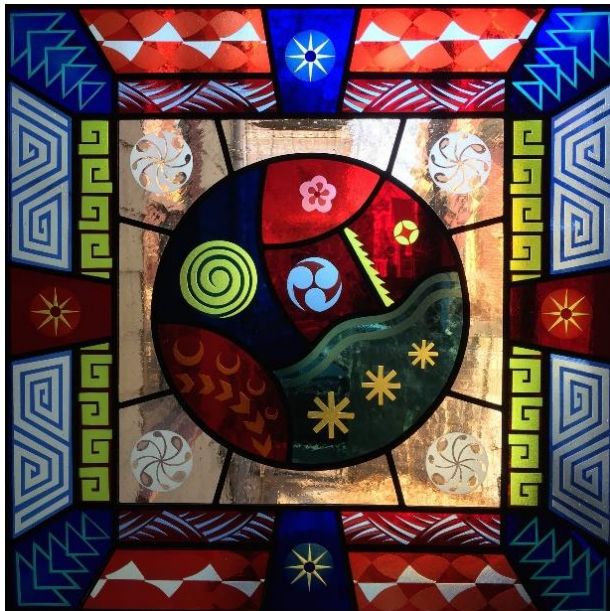
Deco Circle , stained glass, 23" x 23" x 2"