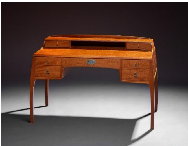
Inverness Desk , Mahogany, nickel silver, 35" x 42.5" x 22"