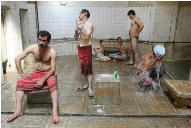
Public Baths , Photography, 30 cm x 45 cm