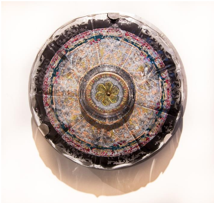
Good Looking , Domestic objects, fabric, machine embroidery, pearl, steel, 15.5" x 15.5" x 3"