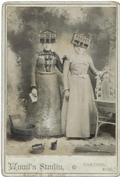
House Heads (RJD) , acrylic paint on vintage photograph, 6.5" x 4" x .1"