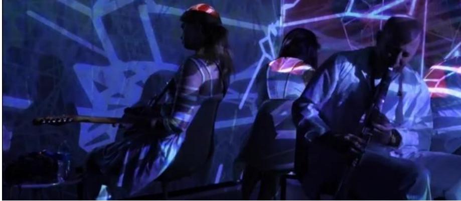
Arachnodrone / Spider's Canvas