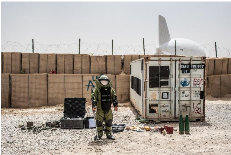
Bomb Suit, Kandahar. , Inkjet print, 30" x 40" x 1"