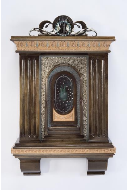
Goodnight Sweetheart , Steel, Paint, White Gold, Bronze, 36" x 22" x 7"