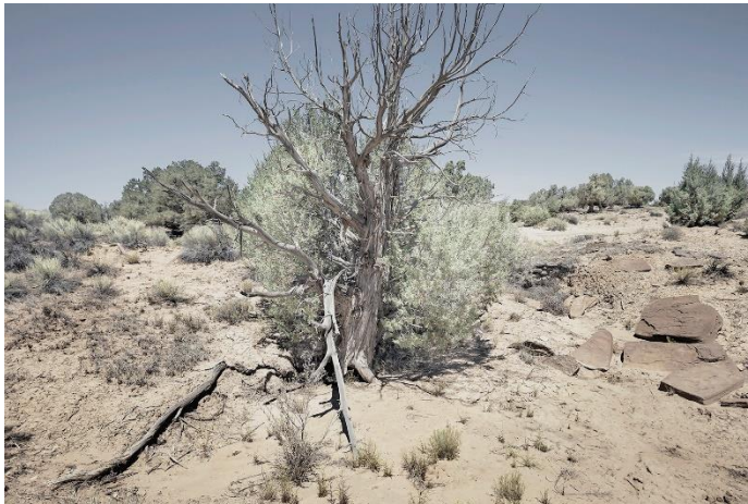
Big Uncle's Spring, Painted Desert, AZ , archival pigment print, 20" x 30" x 1"