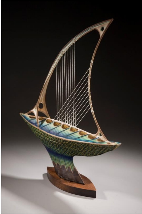
Sea Harp , Abaca pulp, samaras, steel, thread. Waxed linen, pigments, 24" x 20" x 5"