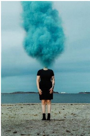
Imaginary Brother , Photography, 12" x 8"