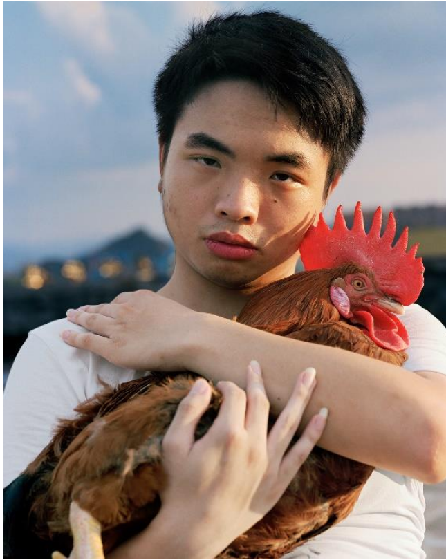
Boy with Rooster , Archival Pigment Print, 30" x 24"