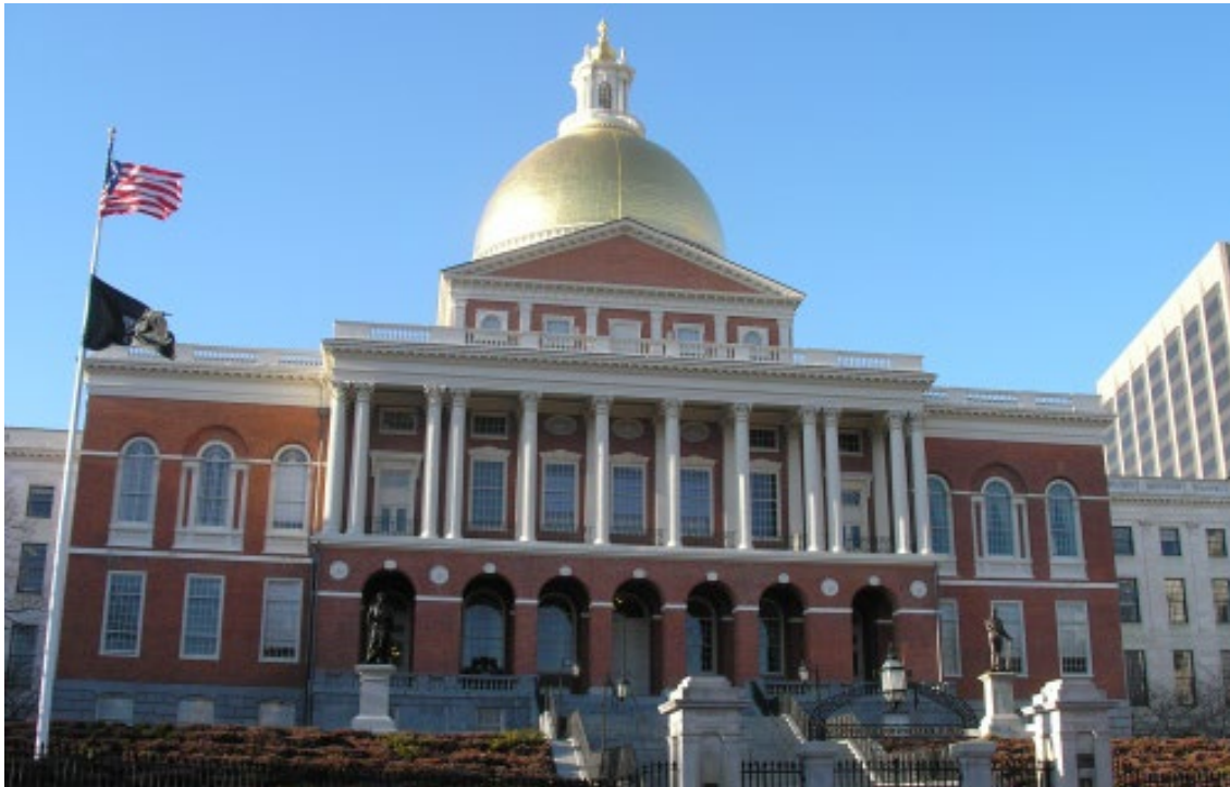
Massachusetts State House