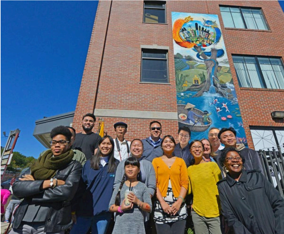
"A Mural for Vietnamese People" by Ngoc-Tran Vu